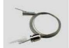
Aircraft Steel Pendant Cable