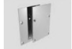
Aluminum End Caps