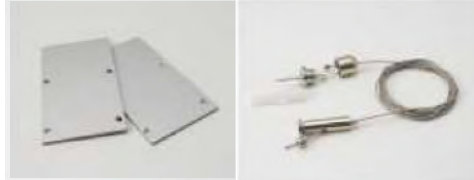
Aluminum End Caps Suspension Wire